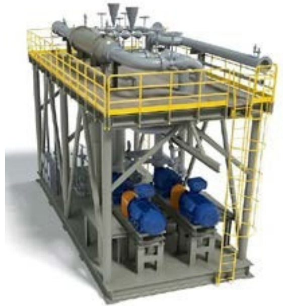
Package for FPSOs